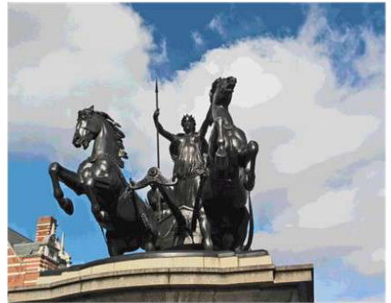
Racing chariot - London