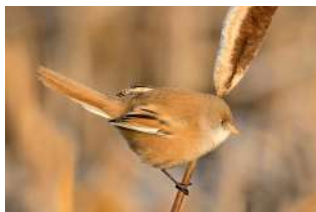
C46 CZECH CONROY CPAGB - Bearded Reedling

Non award winning images from 2017 Exhibition (also see page 15)