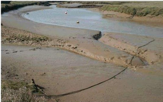
Low Tide - Blakeney Norfolk Norman Moor