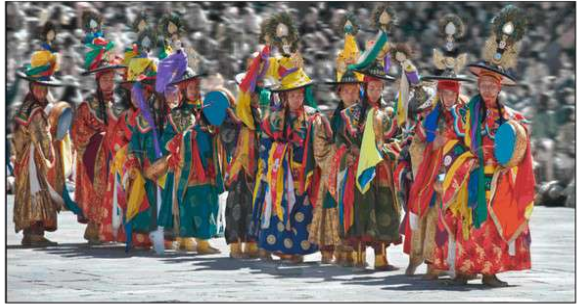
Dance of the Black Hats - Thimpu Bhutan Jonathan Ratnage